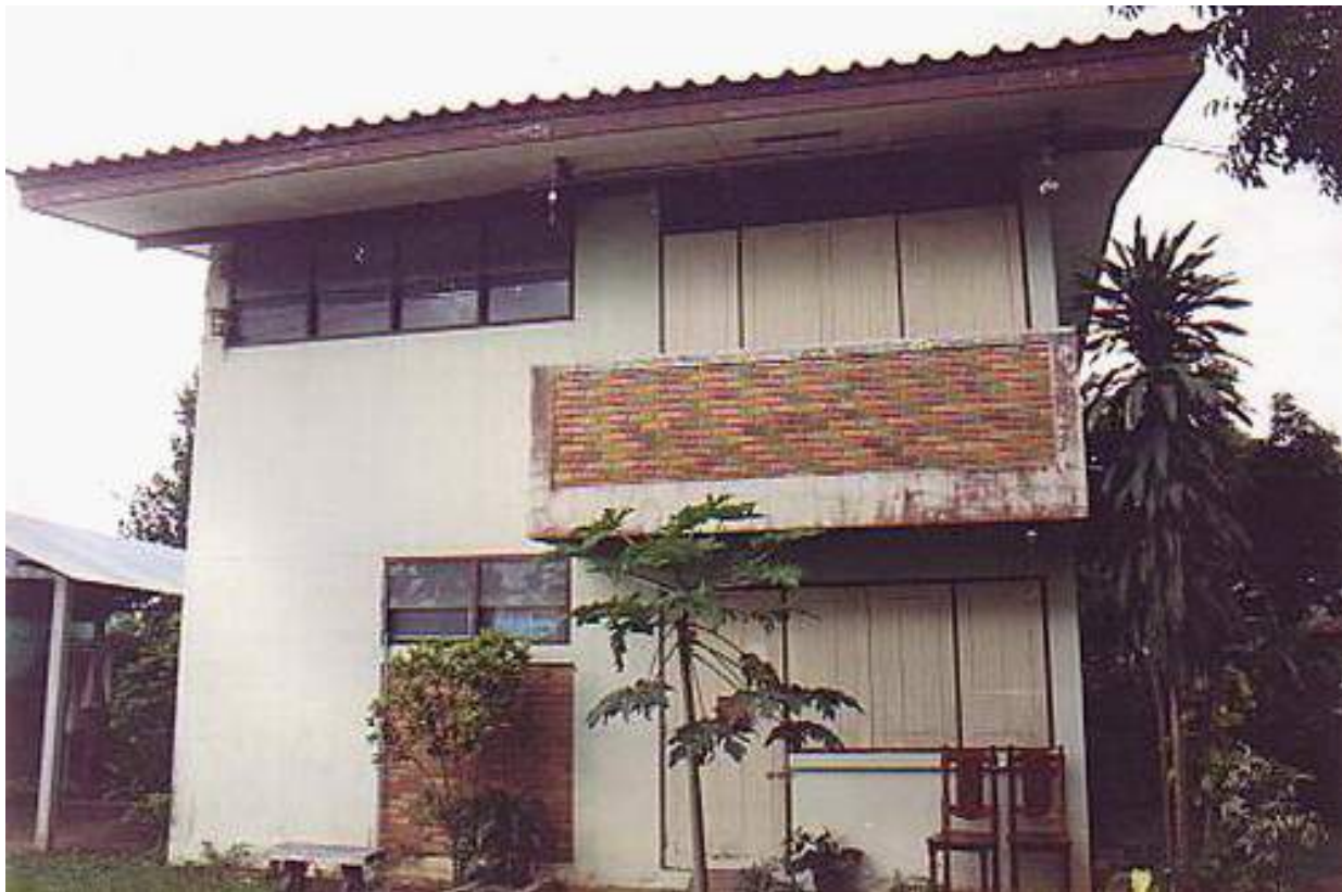
This photo shows the teacher's accommodation.