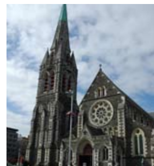
Christchurch Cathedral Square