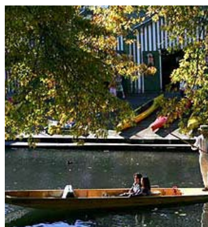
Punting on the Avon River