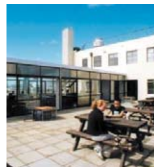
The roof-top café