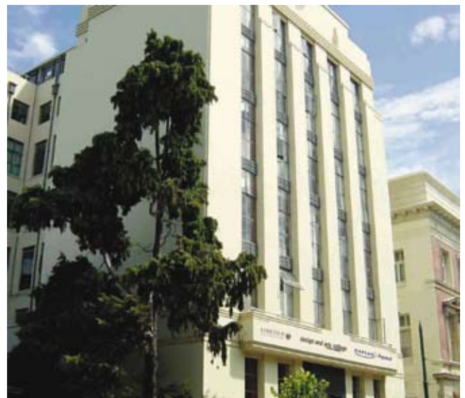
Kaplan Aspect Christchurch

Kaplan Aspect Christchurch is ideally situated in the city centre next to Cathedral Square and within a moment’s walk from cafes, bars, shops, libraries and central bus routes.