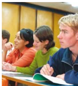
Students in the classroom