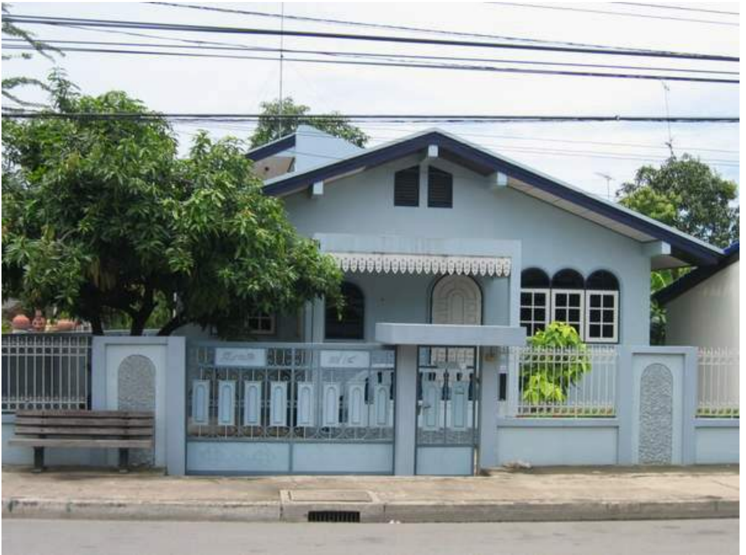
The outside of the teacher's accommodation.