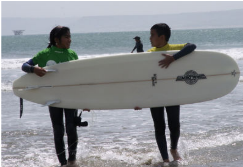
Youth participants in WAVES' Educational Surf Programming

The information in this pack is meant to expand on the information on the WAVES for Development website www.WAVESfordevelopment.org . Please ensure you have read the information on the website as a starting point.