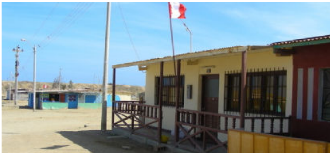
"The WAVES house"