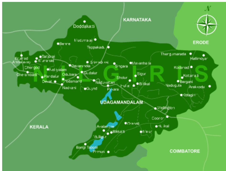
Map of The Nilgiris District, Tamil Nadu, India