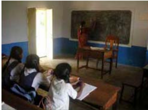
Tribal children at school

Touchwood intends to increase the infrastructure of this school and aims to provide better facilities to ensure that these children have a better tomorrow. We welcome inquiries regarding our work with this school and will be happy to provide any information that is required.