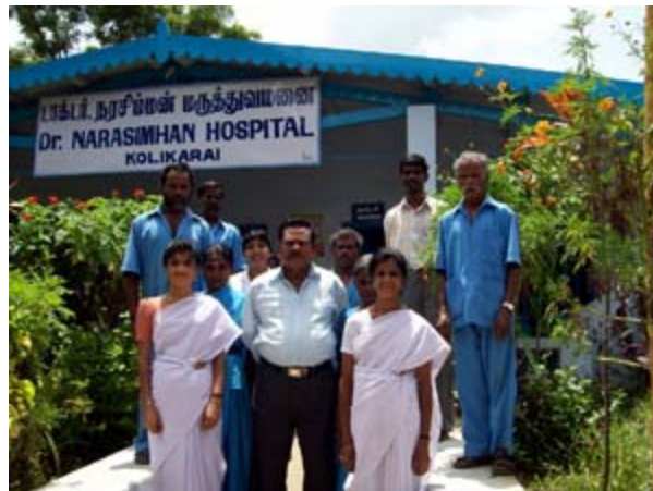
NAWA's Dr. Narasimhan Hospital at Kolikarai