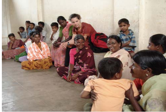
Public health education program

Preventive measures involving environmental, educational, and outreach activities are combined with therapeutic measures into a single healthcare system.