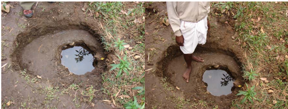
Existing alternate water resources for Chemmanatham Village

On finalization of design and costs associated, Touchwood will submit an in-principle proposal to the government seeking permission to take this further.