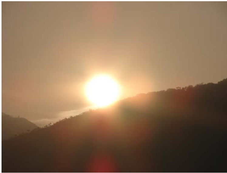
Touchwood – the dawn of a new beginning