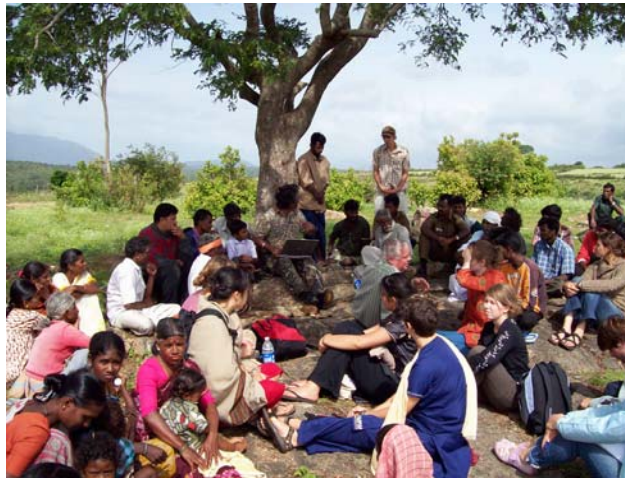
Touchwood volunteers at a village meeting

Touchwood is headquartered in Kotagiri, India, a small town in the heart of the hills of the Nilgiris. Touchwood's most significant asset is a highly qualified team of international volunteers. With experience spanning many continents in both the nonprofit and for-profit sectors, this human capital ultimately increases the efficiency and effectiveness with which were able to operate. We believe that this unique quality will help ensure Touchwood's long-term viability.