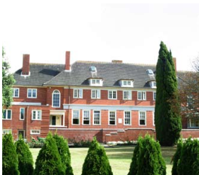
Kaplan Aspect Auckland

The Auckland school is located in one of the city's most popular areas between the Domain, a beautiful public park, and the lively Newmarket district, with its chic shops, bars and cafes. It is also just a 5 minute walk from Parnell Village with its unique colonial atmosphere.