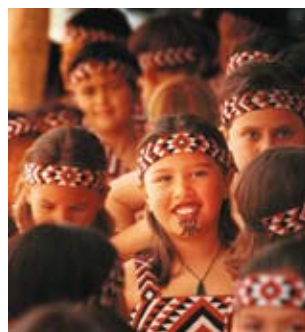
Experience some of the New Zealand culture by joining activities programmes