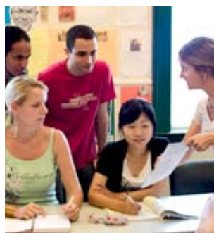
Kaplan Aspect teacher and students

There are two outdoor areas on either side of the school which are used by students for soccer and other games. The activities coordinator will help with organising sports events. Students can join the local gym for indoor sports and fitness training.