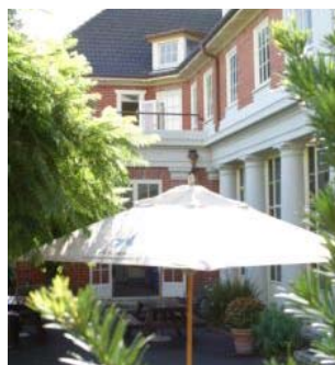
Patio area at the back of the school