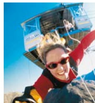
Kaplan Aspect student activities