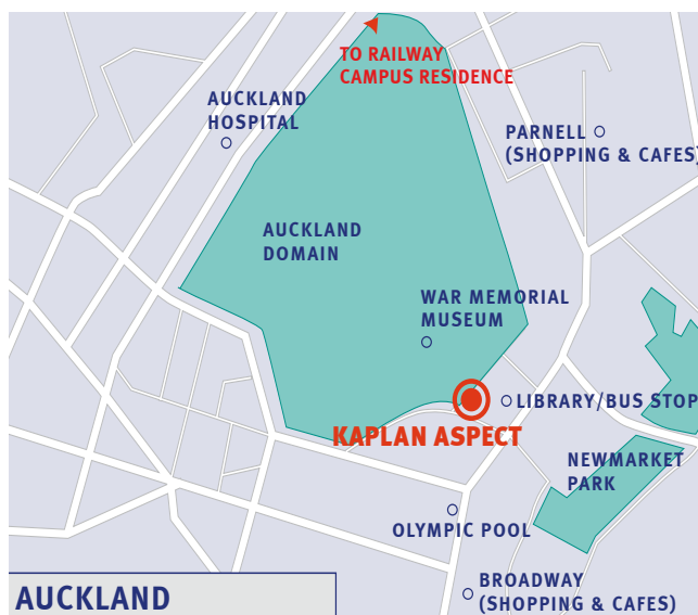
Kaplan Aspect Auckland 10 Titoki Street Newmarket Auckland