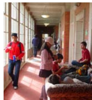
Interior of the school