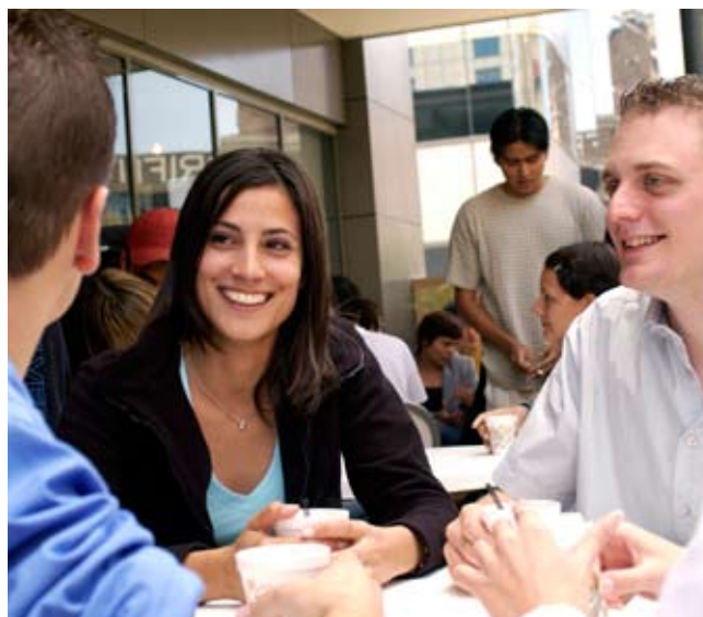
The student café balcony

$14 one way will take the student from Domestic or International Airport to Circular Quay, Town Hall or Central Station, where student can catch a connecting bus, train or ferry. Journey time is approximately 20 minutes.