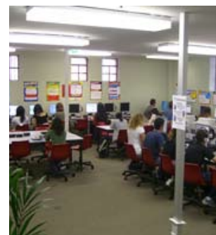
Study centre / library