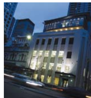
Kaplan Aspect school