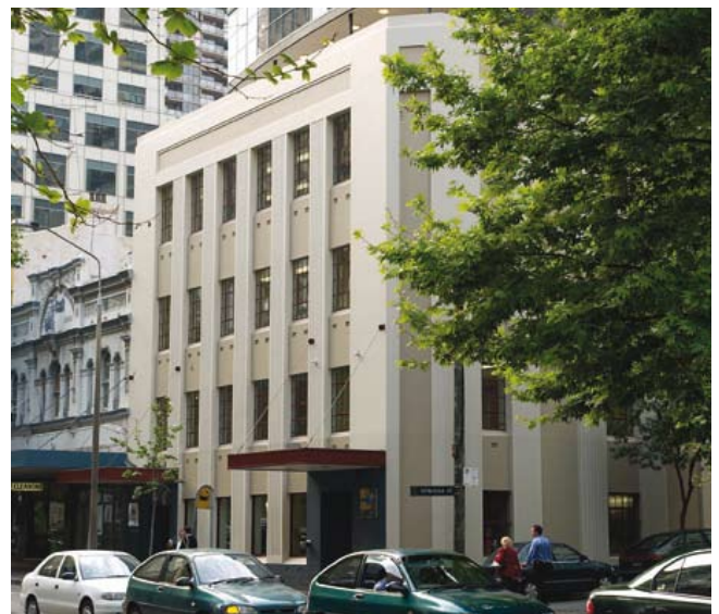
Kaplan Aspect Sydney

For the perfect mix of stunning surroundings, offering beach life, a thriving cultural scene and the excitement of a vibrant metropolis - Sydney is the city to be in. At the end of a day of classes, sit back and drink a cappuccino at a harbour front café and when the weekend arrives, head for Bondi where 'Sydneysiders' soak up the sun and enjoy world-class surfing.