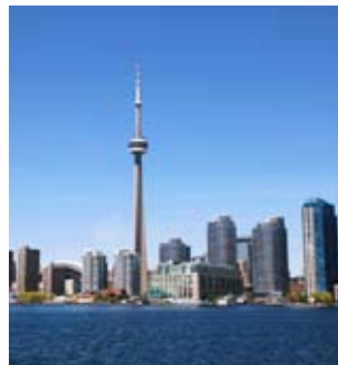
Toronto view and the CN Tower