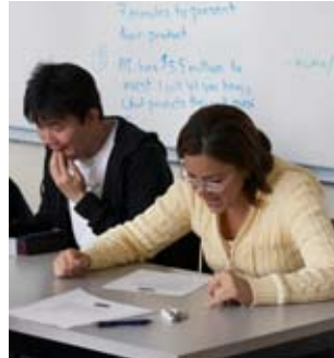
Students in class

There are numerous places of worship in the surrounding areas of the school.