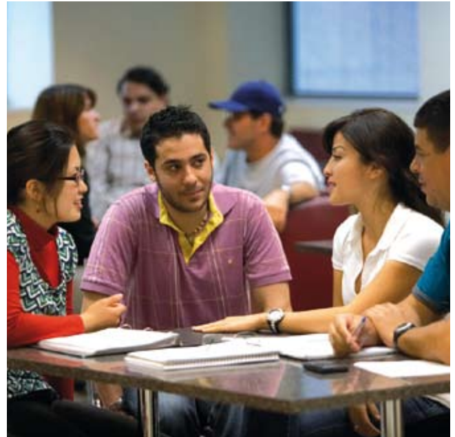
PLI Toronto students

Taxi services costs approximately $40 - 60 (add 10-15% tip) to get to your homestay or downtown. The drive averages about 45 minutes depending on where you live.