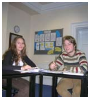
Kaplan Aspect students in a classroom

Kaplan Aspect arranges a full schedule of excursions and activities including excursions to the famous museums, clubbing evenings in Soho and West End theatre trips.