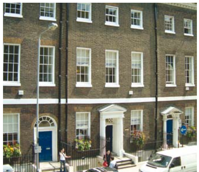
Kaplan Aspect London

Kaplan Aspect London is situated in a historic, listed building dating from the 18th century which has been fully refurbished and modernised. Located just a 5 minute walk from Covent Garden, the school really is in the heart of London.