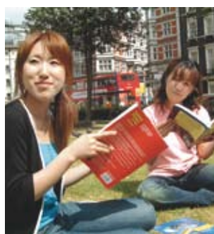
Kaplan Aspect students