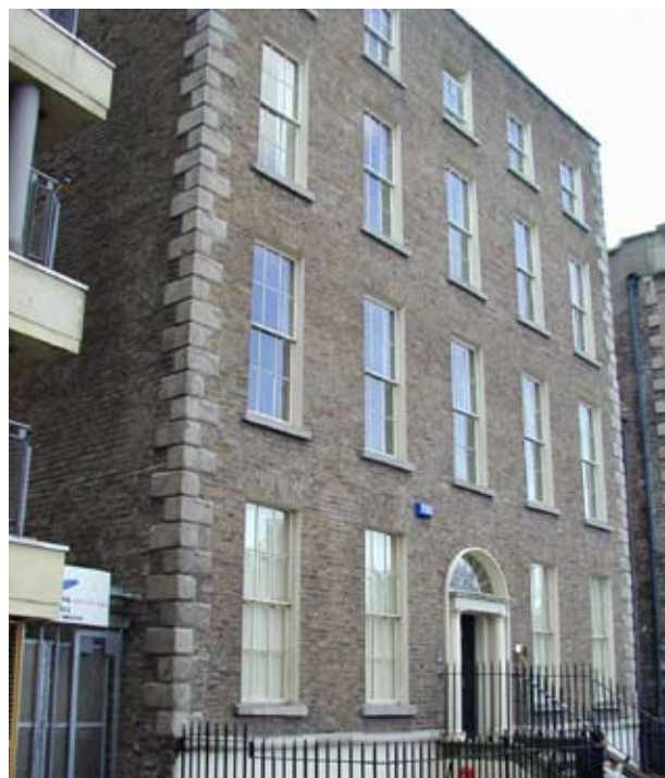
Kaplan Aspect school

The Kaplan Aspect School is housed in a magnificent Georgian building overlooking the River Liffey. The excellent facilities include a large student common room with new flat-screen computers for personal use, a self-study room, a dedicated study room and free wireless Internet access.