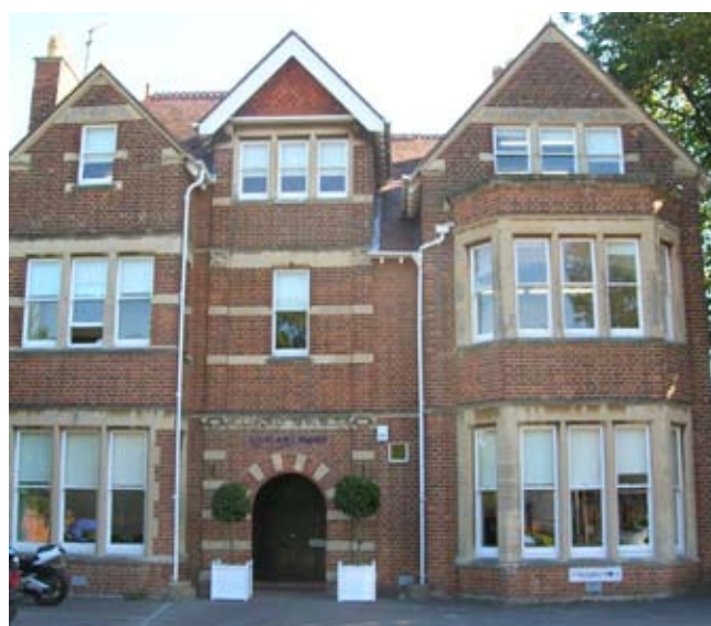
Kaplan Aspect Oxford

Kaplan Aspect Oxford is housed in an attractive Edwardian building with 3 floors and a modern, prize winning extension. The school is situated just 10 minutes north of Oxford's city centre and has a beautiful garden and courtyard at the back of the building: the perfect area for summer barbeques and sporting activities.