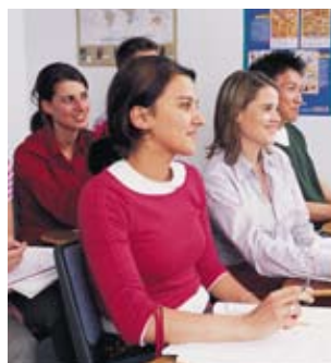
Kaplan Aspect students in the classroom

Our full time social organiser helps ensure that students get as much out of their stay in Oxford as possible. We always ask our students to let us know what activities they are interested in to plan the programmes you want!