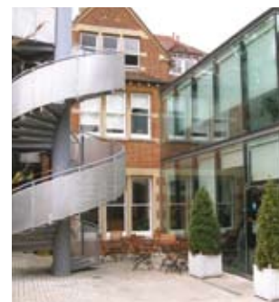
Outside of the school café