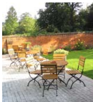
The school garden area